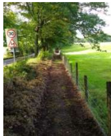
... and - After