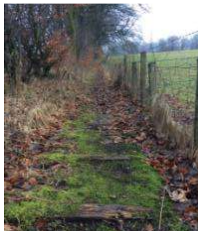
New Broadmeadows path – Before...